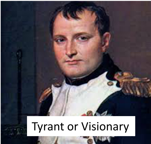
Tyrant or Visionary