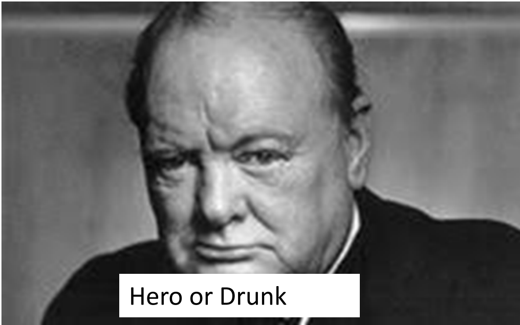
Hero or Drunk