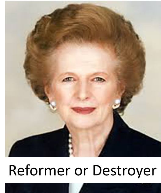
Reformer or Destroyer