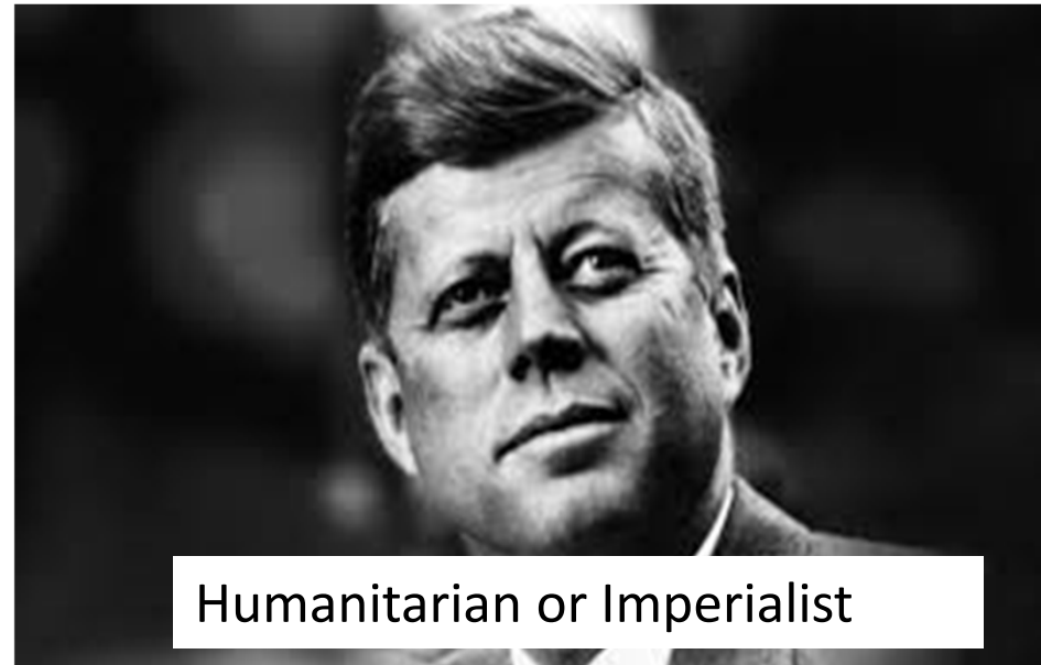
Humanitarian or Imperialist